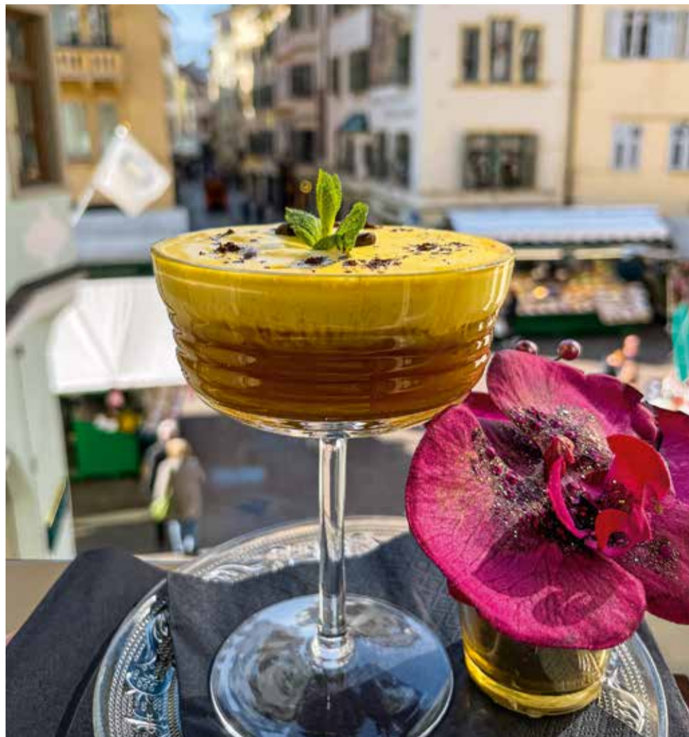
The traditional Thaler house under the "Bozner Lauben"

The champaign bar Thaler Perlage has long become a popular meeting point in the city centre of Bolzano. A place to relax, to enjoy the good and the beautiful. ☺